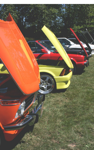
Inside or out of the car, BMW has attracted, a large audience, our club chapter alone sports over 650 members!

BMW CCA Oregon Chapter Pro-tem President