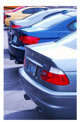
All lined up and ready for pictures!

For more on Silver Falls State Park—go to http:// www.oregonstateparks.or g/park_211.php