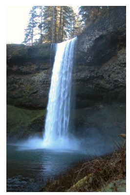
Silver Falls State Park, Oregon.